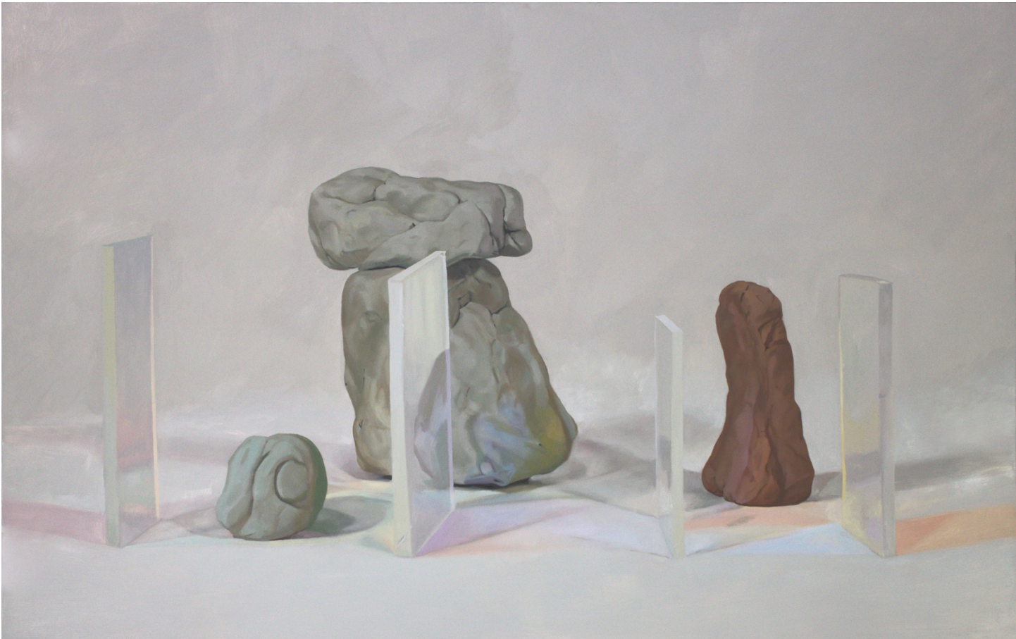
Why Don't You Sit Down and Learn to Play the Game, 2023 Oil on canvas, 38" x 60" $5,000