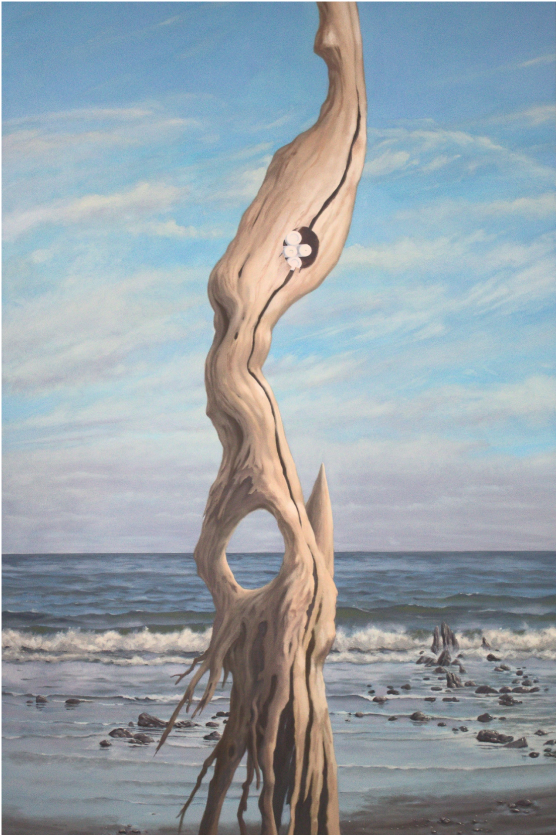
Vadik is Missing, 2022 Oil on canvas, 60" x 48" $6,500