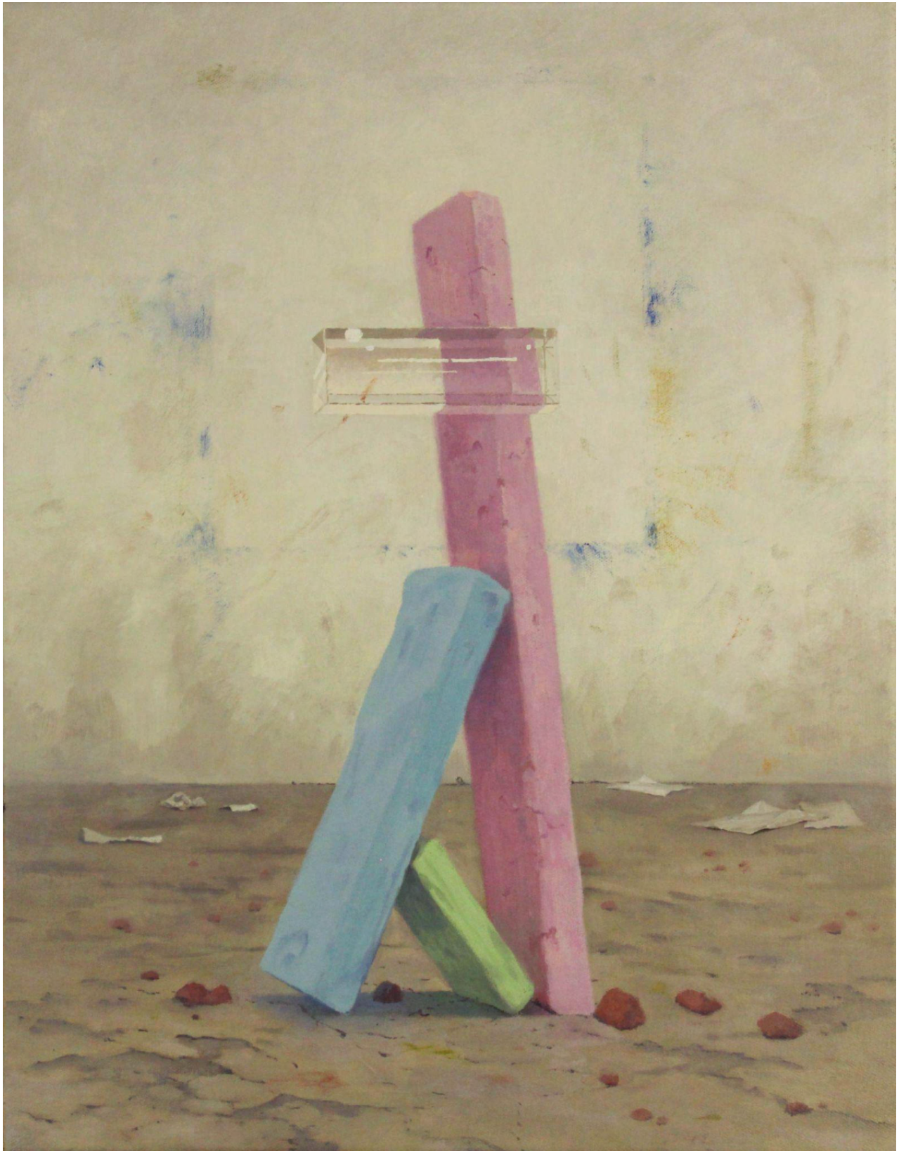
What Angel Makes Light?, 2022 Oil on canvas, 20" x 16" $2,000