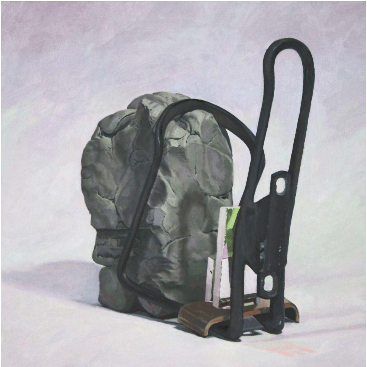
Bad Mask, 2023 Oil on canvas, 24" x 24" $2,600