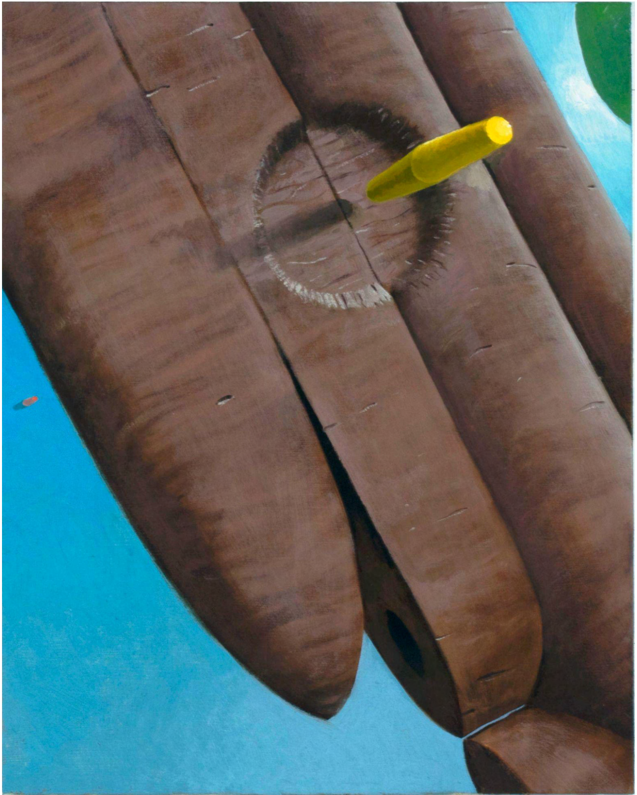
Back To The Land, 2021 Oil on canvas, 20" x 16" $2,000