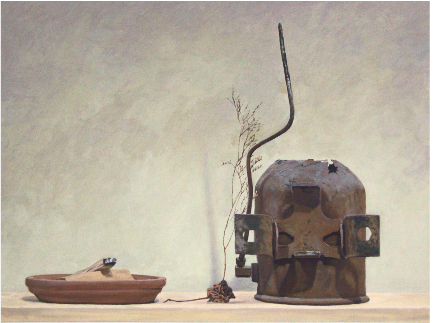
Demons In Real Life, 2023 Oil on canvas, 18" x 24" $2,400