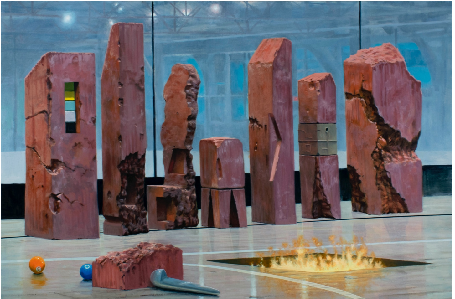
Seven Souls, 2021 Oil on canvas, 48" x 60" $6,500