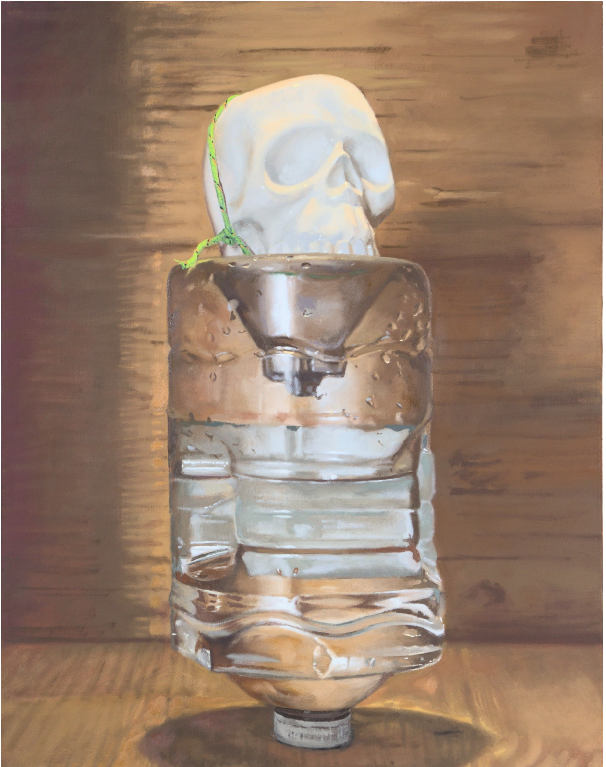
Totem Attempt, 2023 Oil on canvas, 36" x 24" $3,000