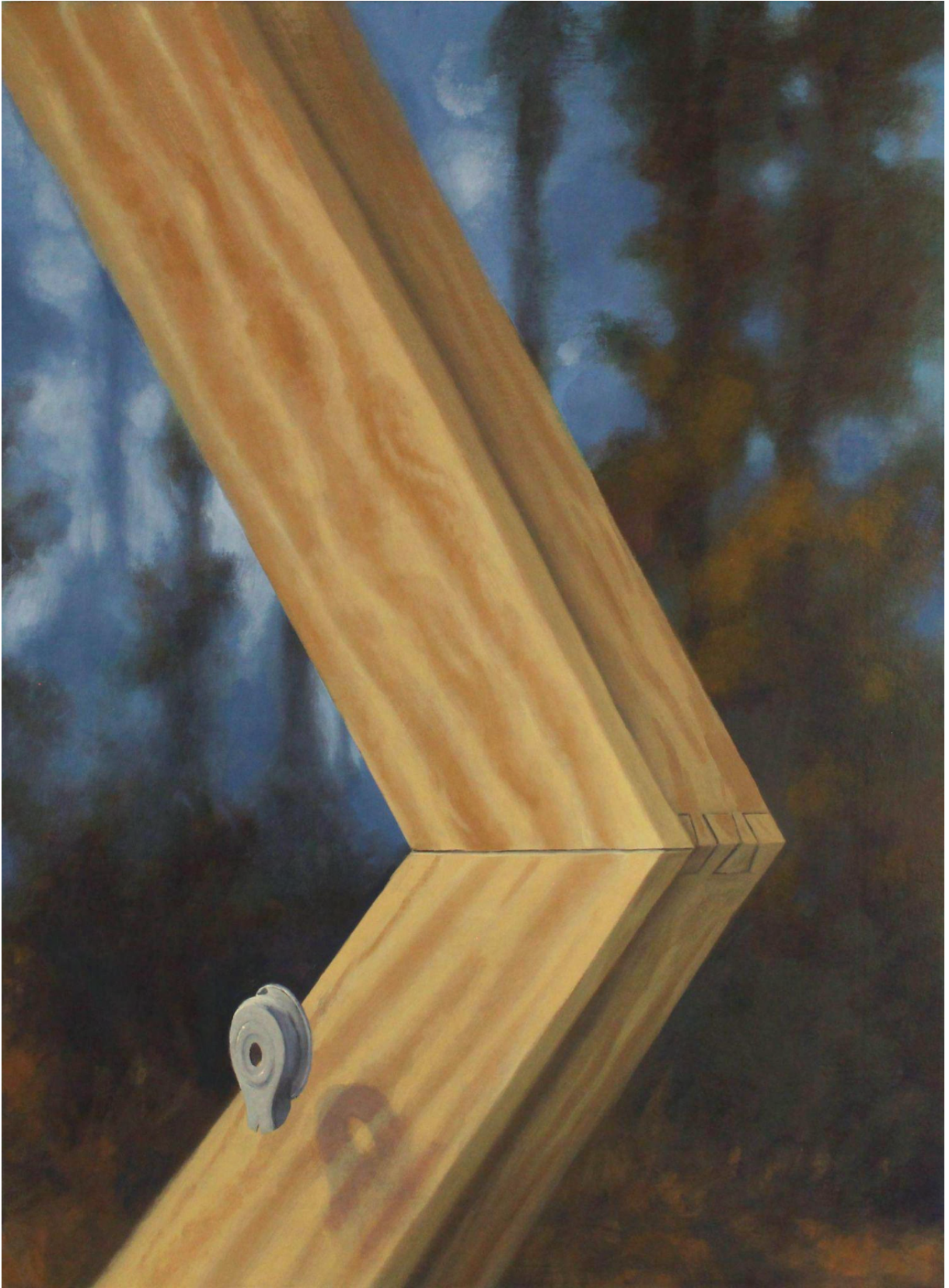
Corner as Insight, as Holy Juncture, 2022 Oil on canvas, 36" x 24" $3,000