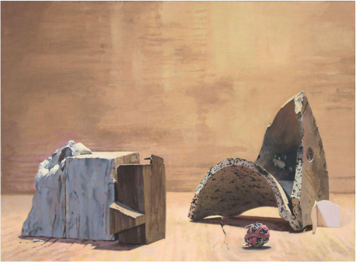
You Put Me On the Street, 2023 Oil on canvas, 18" x 24" $2,400