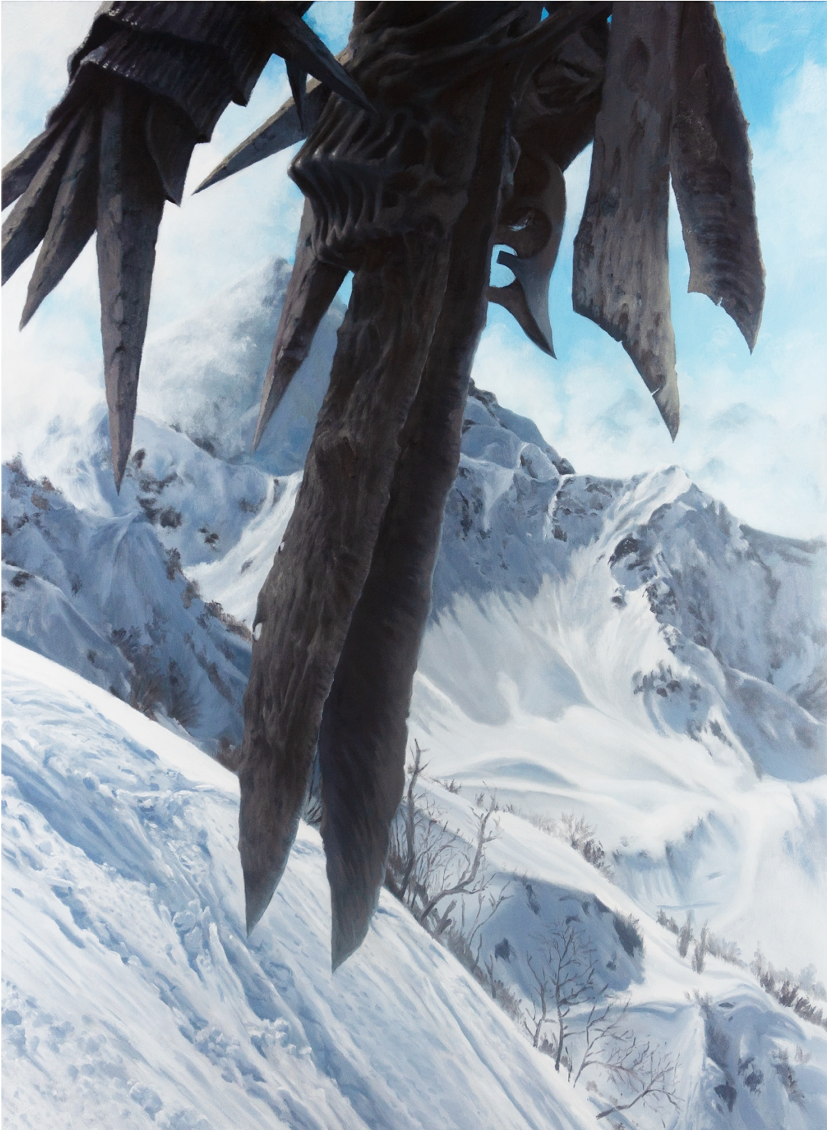
Zauberberg, 2021 Oil on canvas, 48" x 36" $4,000