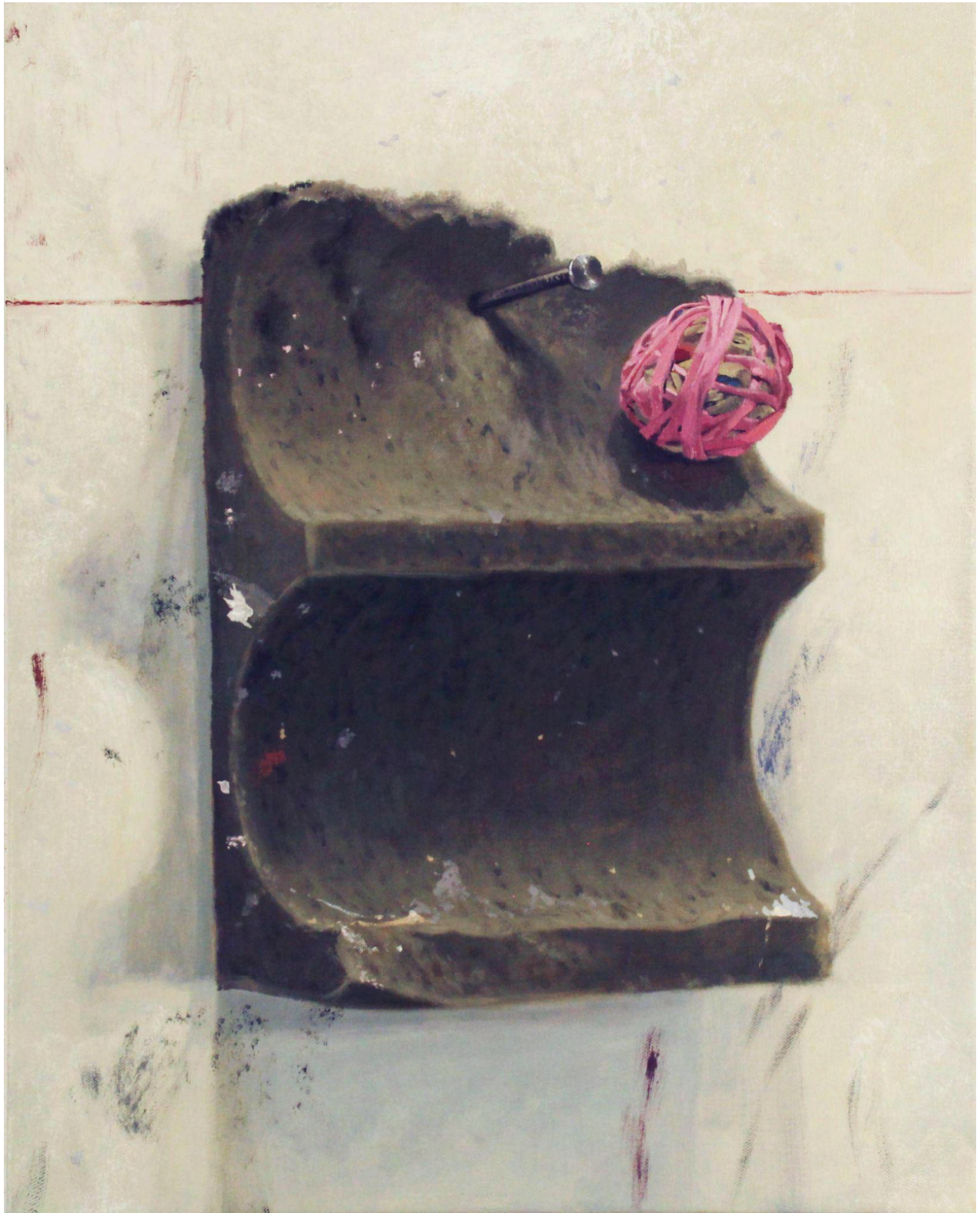
Go On Then Clear Off With Yeh, 2022 Oil on canvas, 20" x 16" $2,000