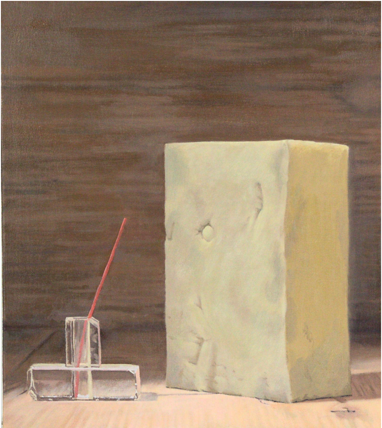
I Was Cold, 2023 Oil on Canvas, 20" x 16" $2,000