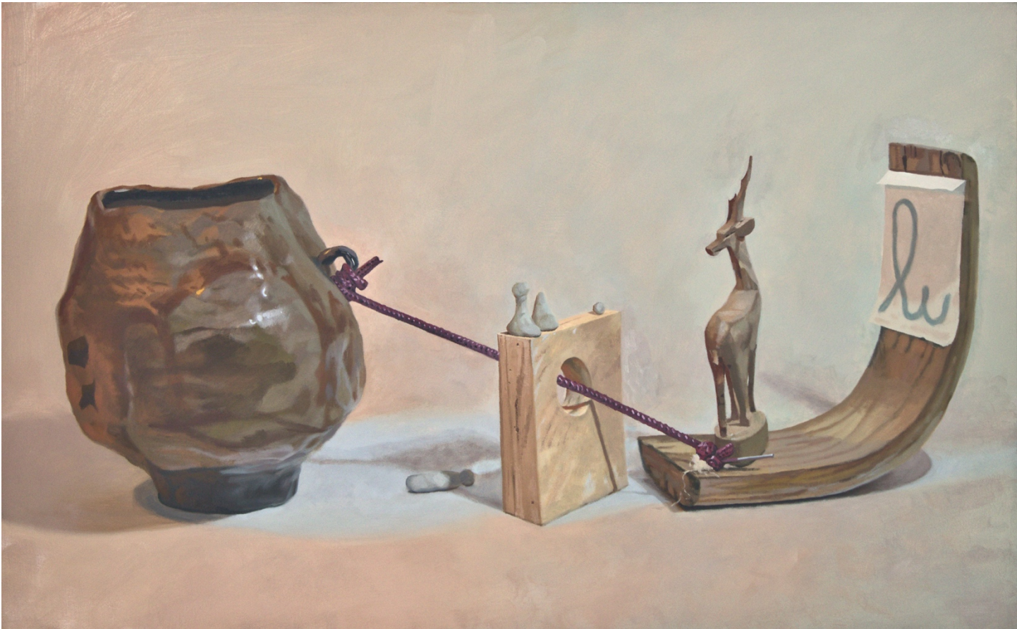
The Animals Are Leaving, 2023 Oil on canvas, 29" x 47" $3,800